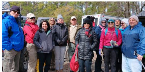
Winter beach clean-up crew!

The Friends Group members get to help lead interpretive programs such as kayak tours, tram tours, guided hikes, and more! Members also greet guests at the visitor center and assist in communicating park needs to the public and governmental officials.