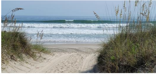
False Cape State Park – A secret gem of Virginia Beach with 6 miles of pristine beach.